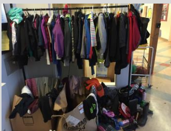
The current pile of found items

If your child has lost we've probably found it. Please drop by and find your child's missing items.